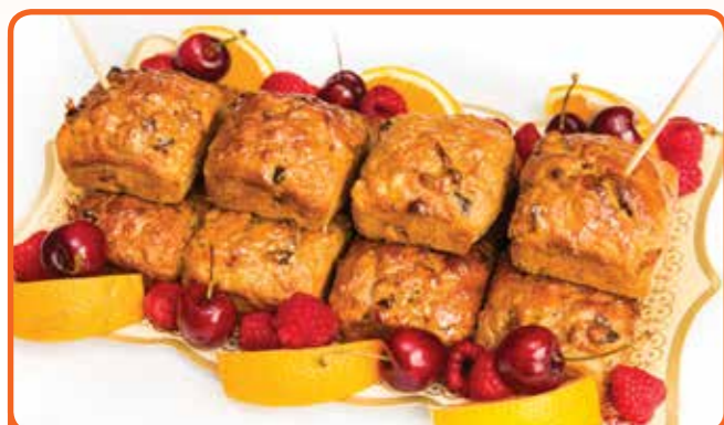
All bakes included 50% fruit